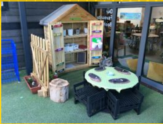
OUTSIDE OF THE CLASSROOM